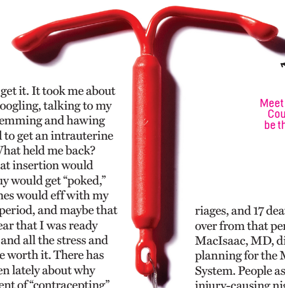
Meet Mirena. Could she be the one?

Listen, I totally get it. It took me about six months of Googling, talking to my husband, and hemming and hawing before I decided to get an intrauterine device (IUD). What held me back? Fear, mostly: that insertion would hurt, that my guy would get “poked,” that the hormones would eff with my sex drive or my period, and maybe that I’d decide in a year that I was ready to get pregnant and all the stress and pain wouldn’t be worth it. There has been a lot written lately about why less than 5 percent of “contracepting” women under 30 use IUDs. Why so few when they are supersafe, effective, and the favored birth control of ob-gyns, plus European women love them, and the American Academy of Pediatrics issued recommendations this past fall that said IUDs are great for teens? Yet this isn’t actually a question I wonder about, because I know! IUDs can be scary.